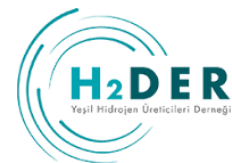
Green Hydrogen Producers Association